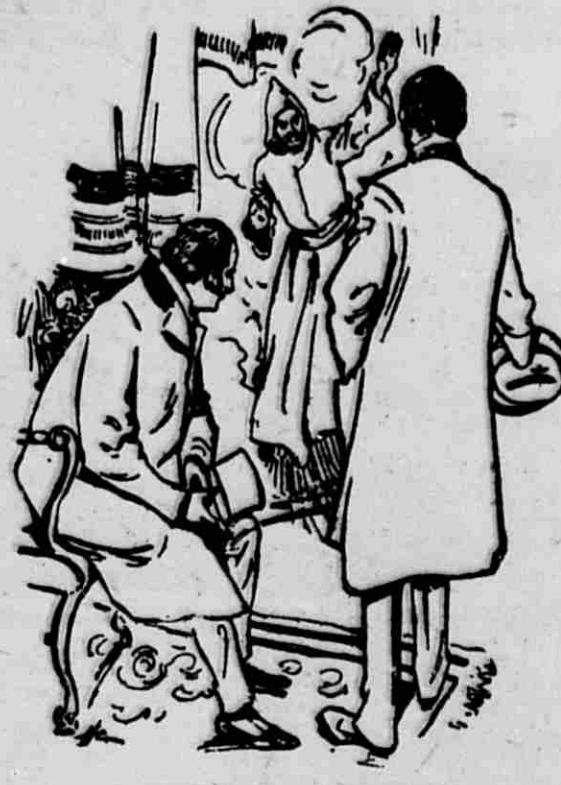
KOLA TURNED FURIOUSLY.

you will be, my dear sir, then you will value the information I gave you just now, and it may mean much to you. It will not take five minutes for the test I propose."